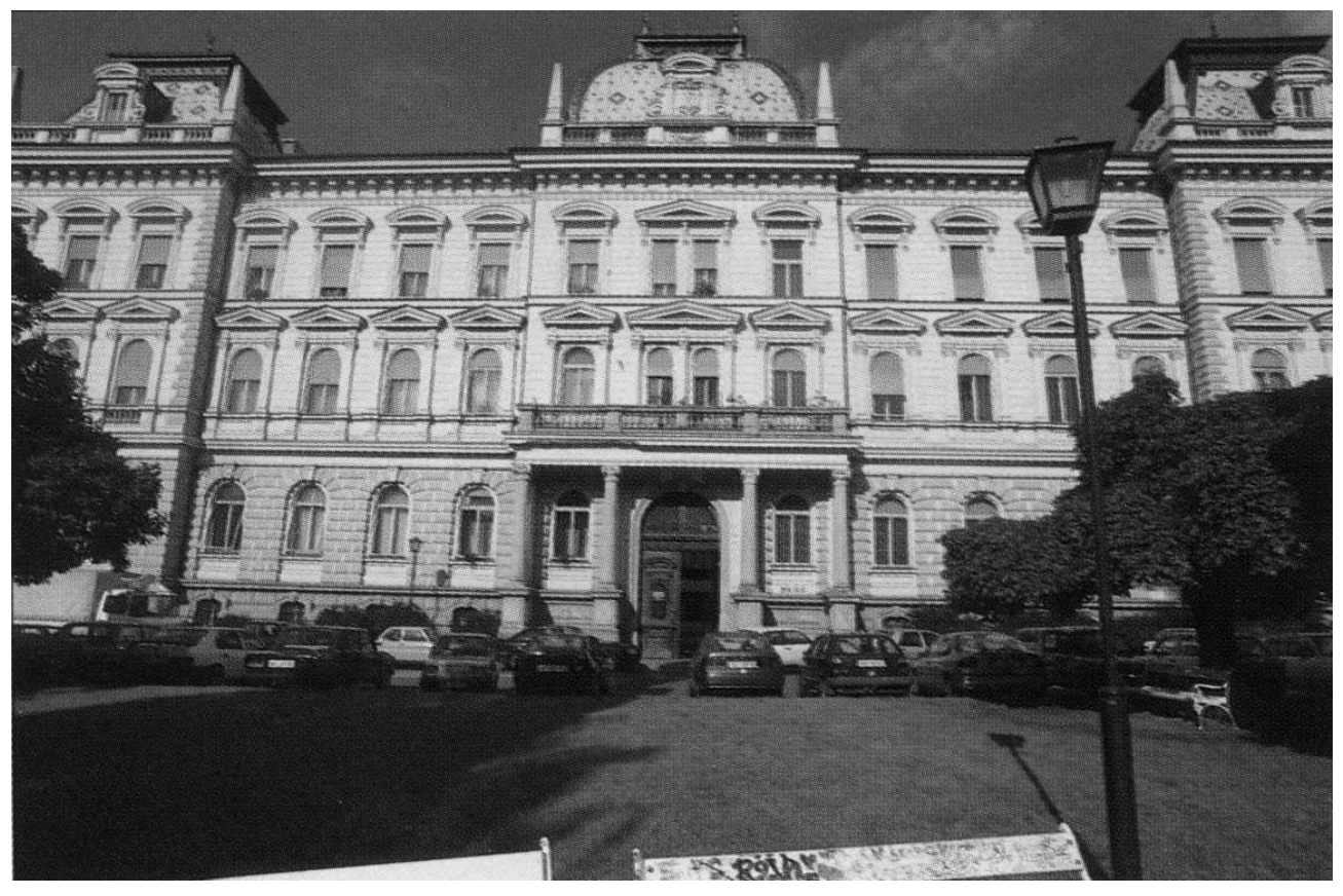
University of Maribor, main building

All registered - admitted participants and interested persons registered on the e-mailing list will receive our regular circularies with the up-to-date information on the School/Conference.