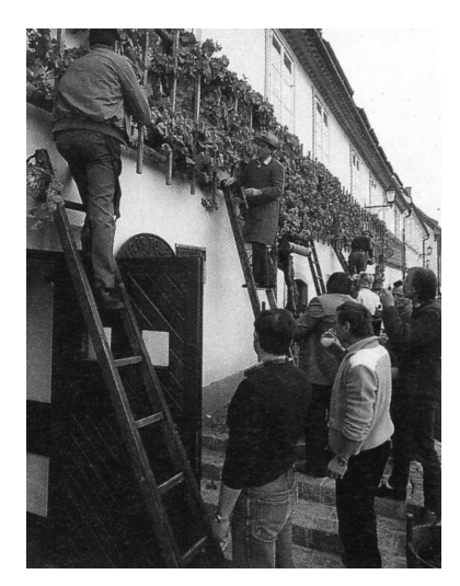
The oldest vine in Europe