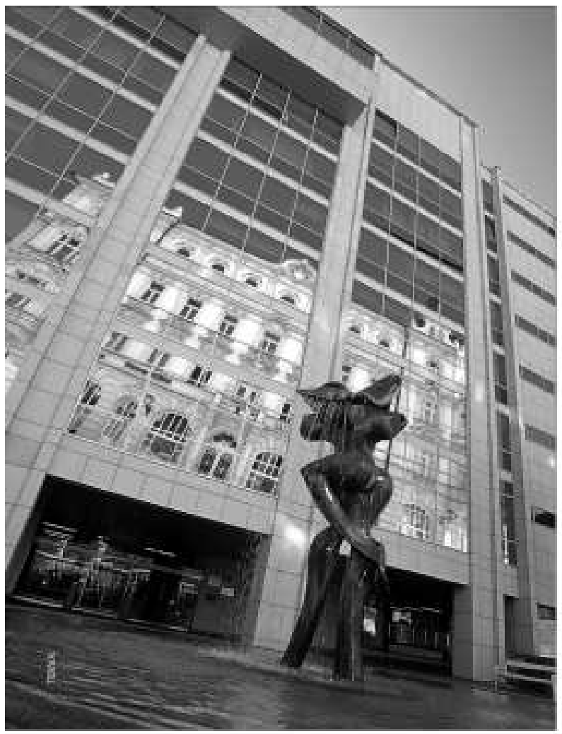
We are stronger than ever before.

The Nova KBM d.d. Financial Group is the leading financial group in Slovenia. It consists of experienced, efficient and successful specialised financial institutions dealing in banking, insurance, leasing, securities trading and fund management.